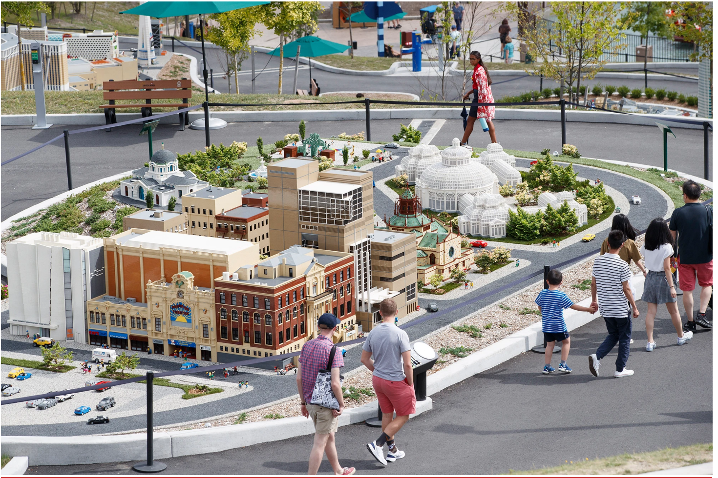
Visitors tour Legoland New York in August.