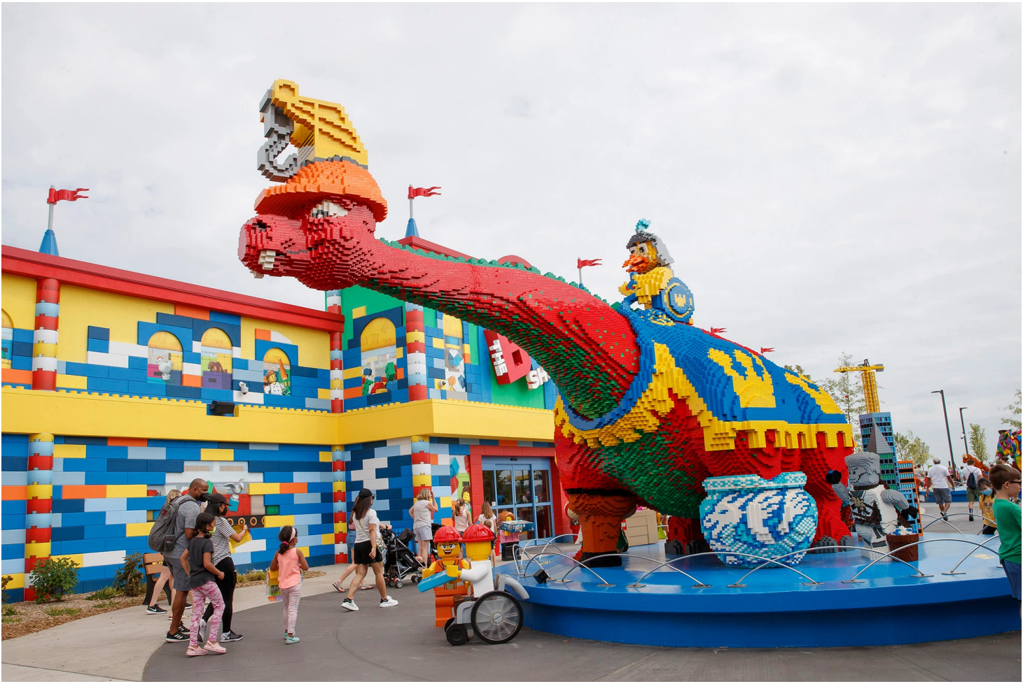
The Big Red Awesome Dino aka BRAD greets guests at the entrance of the park.