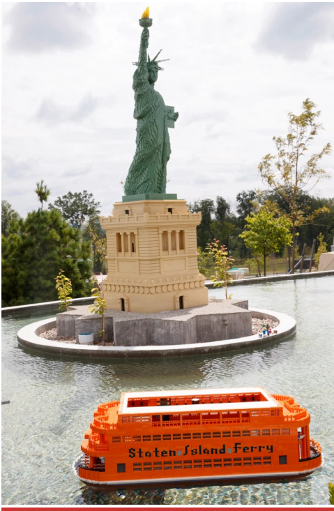
The Statue of Liberty and an accompanying Staten Island Ferry are a part of Miniland.