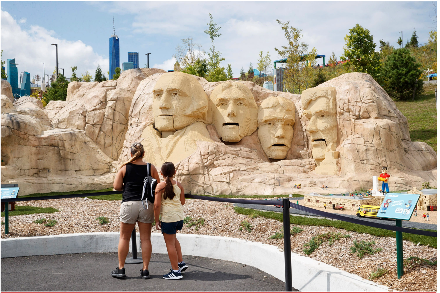
Mount Rushmore gets the Lego treatment.